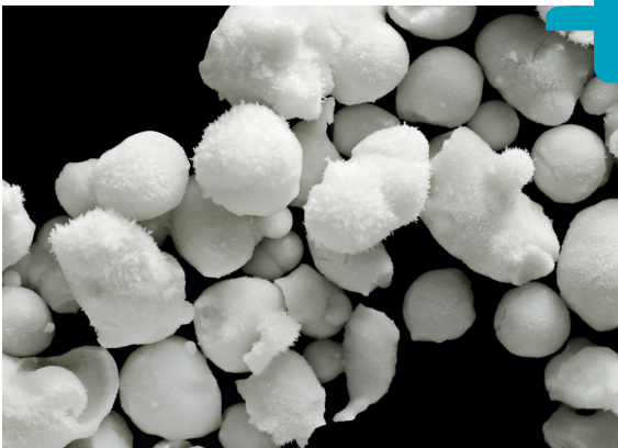
Frozen food cultures

Fermentation has allowed certain foods to become digestible. For instance, fermenting olives, a very hard fruit, makes them soft and palatable. The raw, toxic, manioc-root is transformed into an edible food.