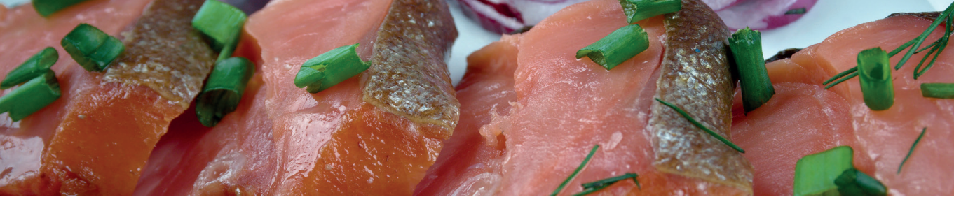
Rakfisk, a Norwegian speciality